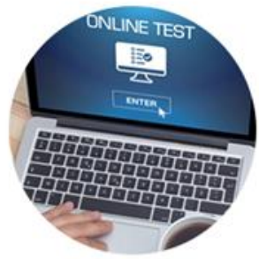
Online Test After Every Module