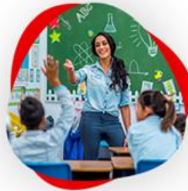
Teacher training and Education