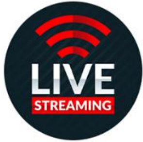
2 Live Class Weekly