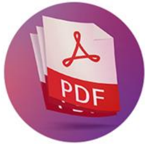
Lesson PDF Document