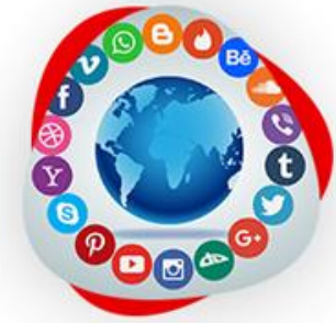
Media and Internet