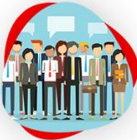
Public service and administration