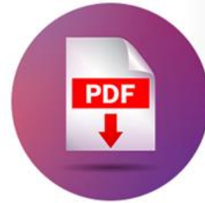
Complete Notes in PDF Format