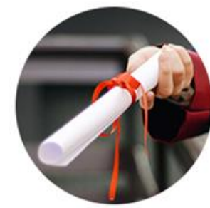
Certificate Delivered by Post