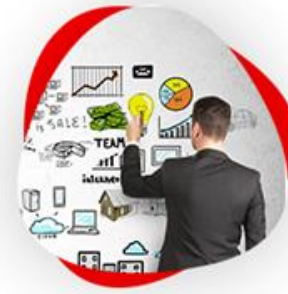
Marketing and Advertising