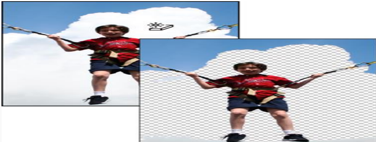
Original image (left), and after erasing the clouds (right)

The Magic Eraser tool changes all similar pixels when you drag within a photo. If you're working in a layer with locked transparency, the pixels change to the background color; otherwise, the pixels are erased to transparency. You can choose to erase contiguous pixels only, or all similar pixels on the current layer.