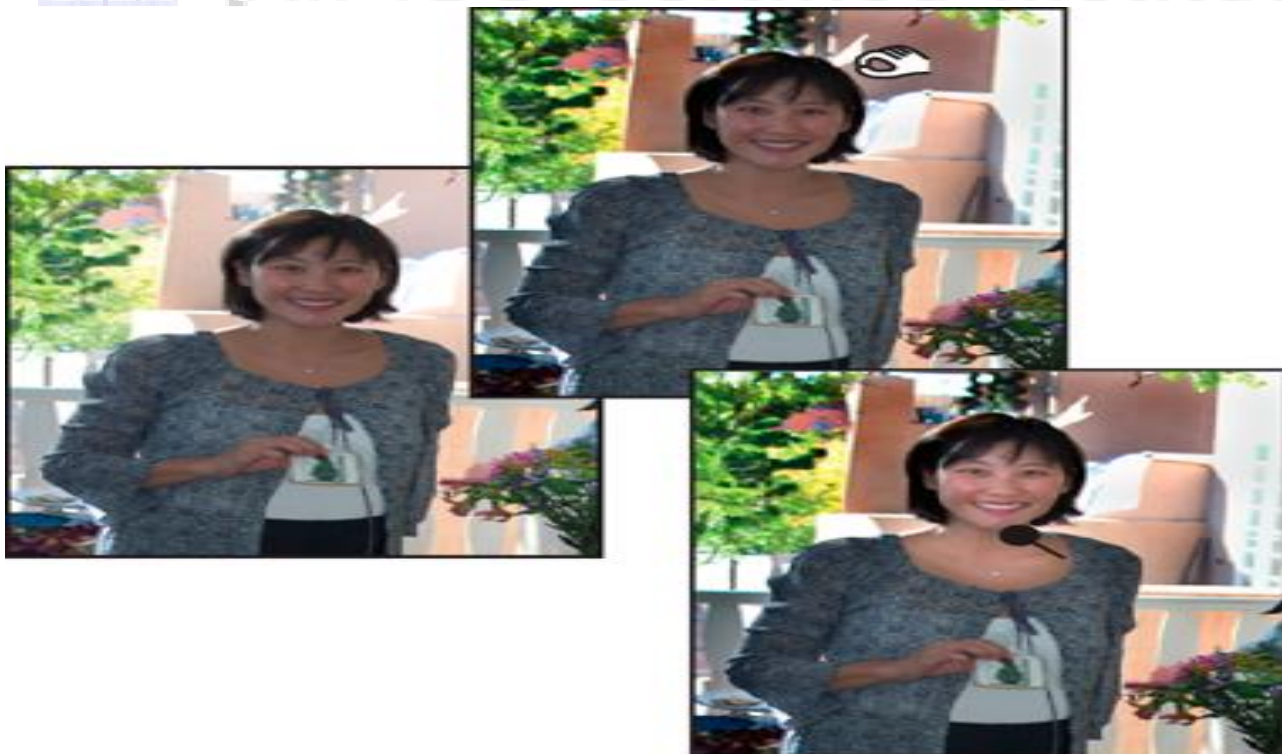
Original image (left), after using the Burn tool (top center), and after using the Dodge tool (bottom right)